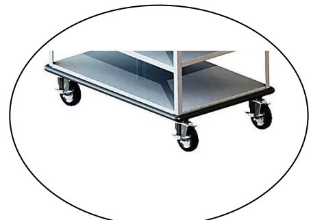
Lower profile model shown w/ wrap-around bumper

© Copyright 2015 Hatch Industries Limited