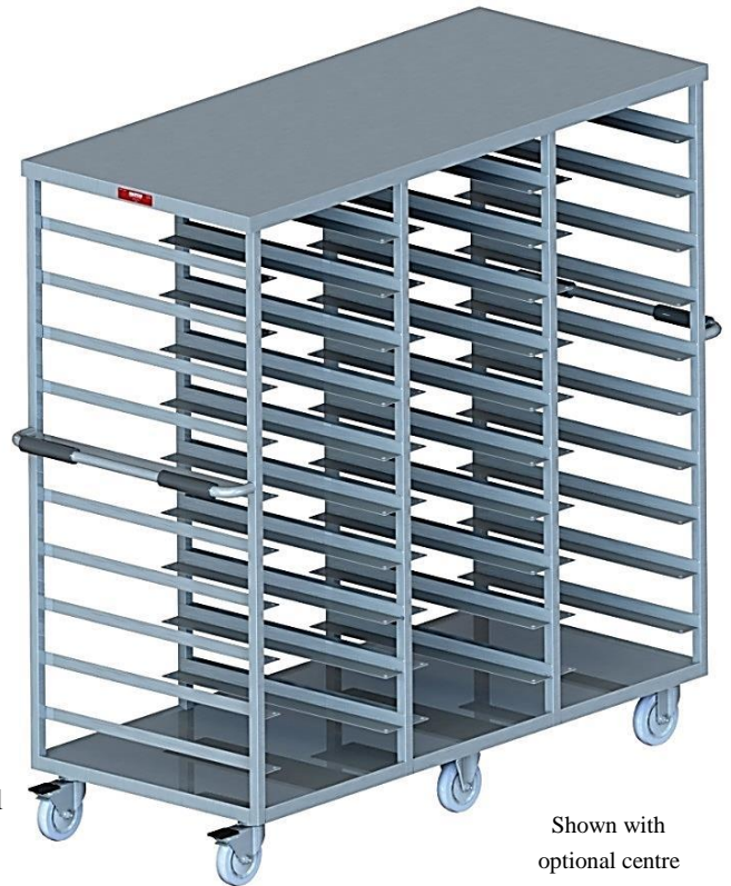
Shown with optional centre casters

Note: “LP” Low profile units available See 480LP & 490LP Series