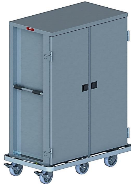
Shown with optional centre casters

© Copyright 2015 Hatch Industries Limited