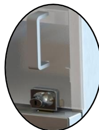
Door lock assembly